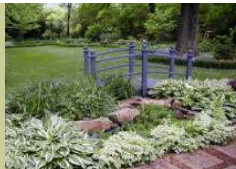
Bridge from MG Peggy Dyer's Garden